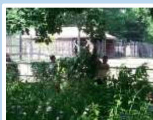
Coding Summer Camp & Lord's Park Service Learning