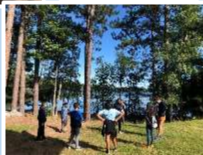
7 th Grade Leadership Camping Trip