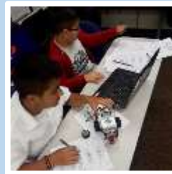
Discovering Science at STEMFest 2019 & Robotics Team Collaboration