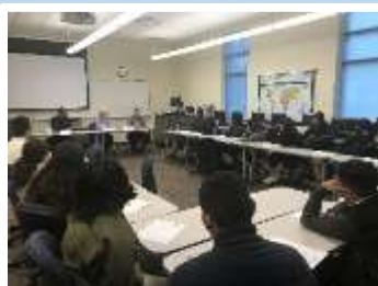
Panel Discussion Learning