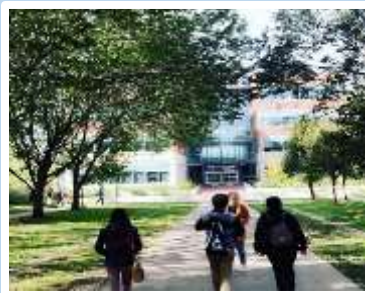
College Visits with College Cafeteria Food