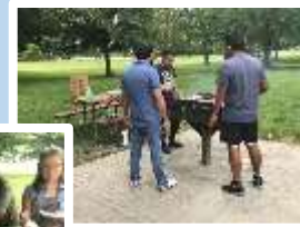
Annual Picnic 2019