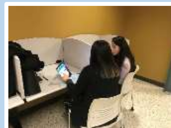
1 on 1 career planning session